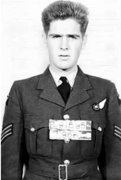
Date unknown.