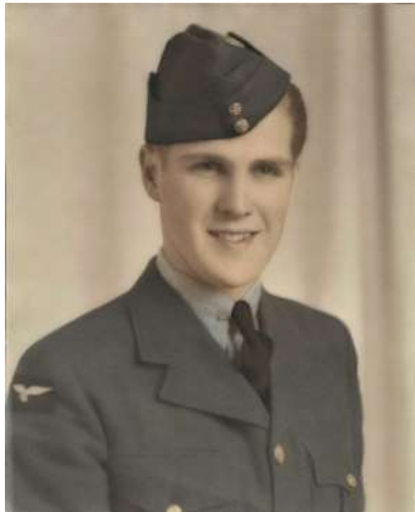
Date unknown

The crash site at Wanroij, the Netherlands. Source: Planehunters. The Planehunters Recovery Team has researched the crash site and recovered some parts of the plane.