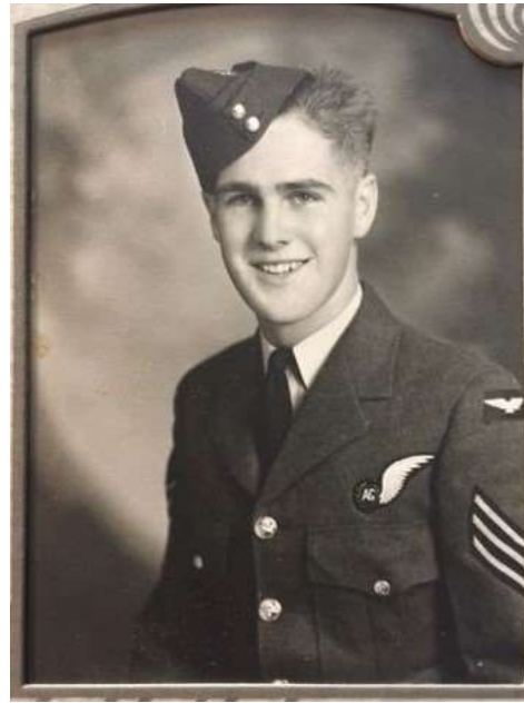
Date unknown.

Observations and findings by the president of board the 9 th of September 1941: "a pleasant, cheerful well-adjusted youngster. Appears alert, intelligent and sensible".